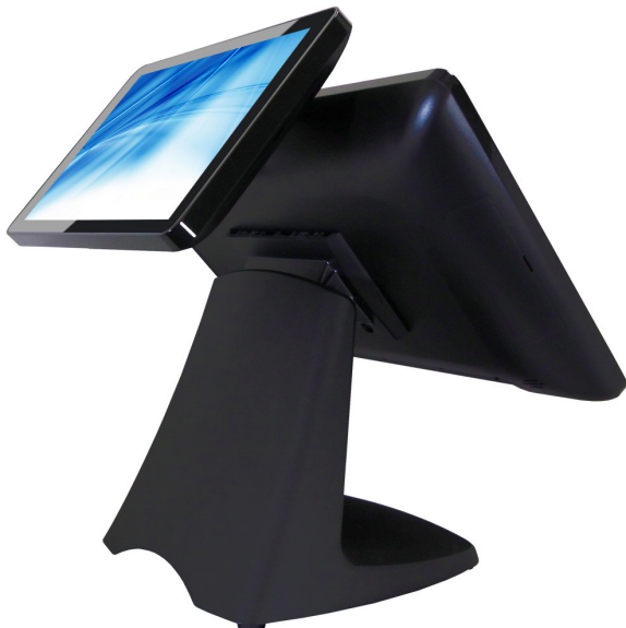
2ND LCD DISPLAY

The all-in-one design allows for the CA250W to be removed from the stand and Vesa mounted (75x75) for a variety of Panel Pc applications.